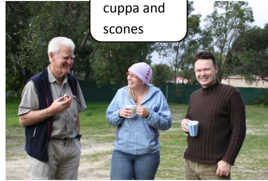
Enjoying a cuppa and scones

Thanks to 35 adults and children from local community who planted 2,000 understorey plants on Sunday 18 th July - Friends group has an easy job of keeping an eye on area. We need help with weeding – come and help us.