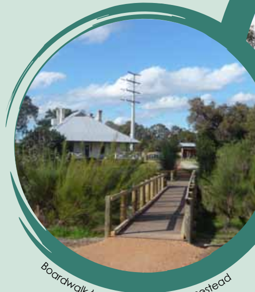
Boardwalk to the Yule Brook Homestead