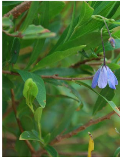
Leaf and stem