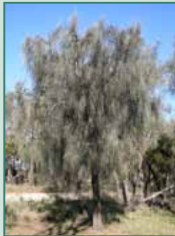
Allocasuarina fraseriana Sheoak

The Trillion Trees Nursery in Hazelmere provides the 4000 local native seedlings planted in each Grove site. They are planted by community volunteers including corporate groups and school children.