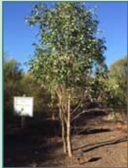
Corymbia callophylla Marri