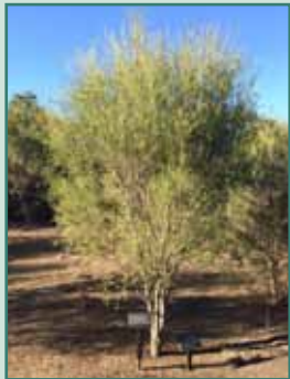
Melaleuca raphiophylla Paperbark