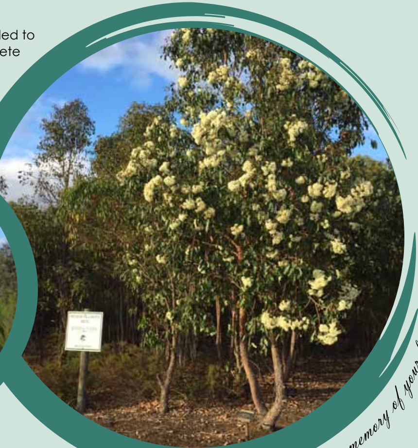
Watch a native tree grow in memory of your loved one