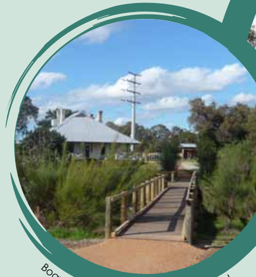
Boardwalk to the Yule Brook Homestead