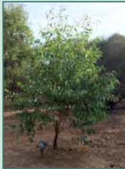
Eucalyptus rudis Flooded Gum