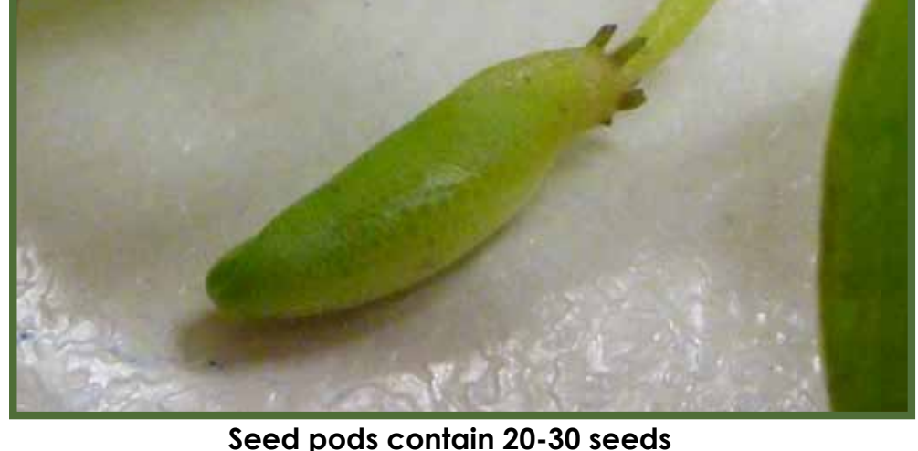
Seed pods contain 20-30 seeds