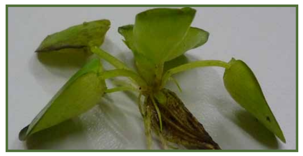
Distinctly enlarged bulge under the leaf of a juvenile plant