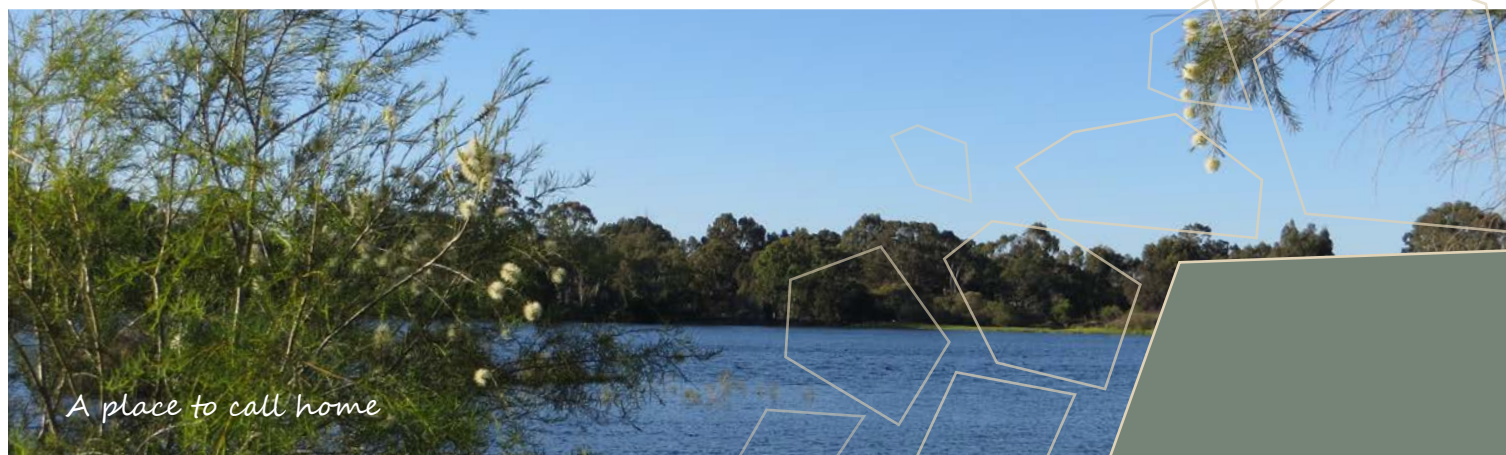
A place to call home