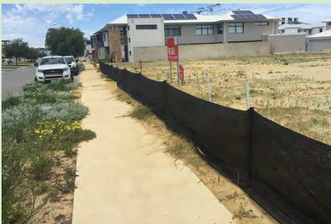
A marked decrease in sand leaving this block after a sediment control fence was installed.