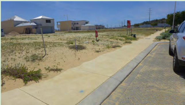
Sand drifting onto the road from a vacant residential block